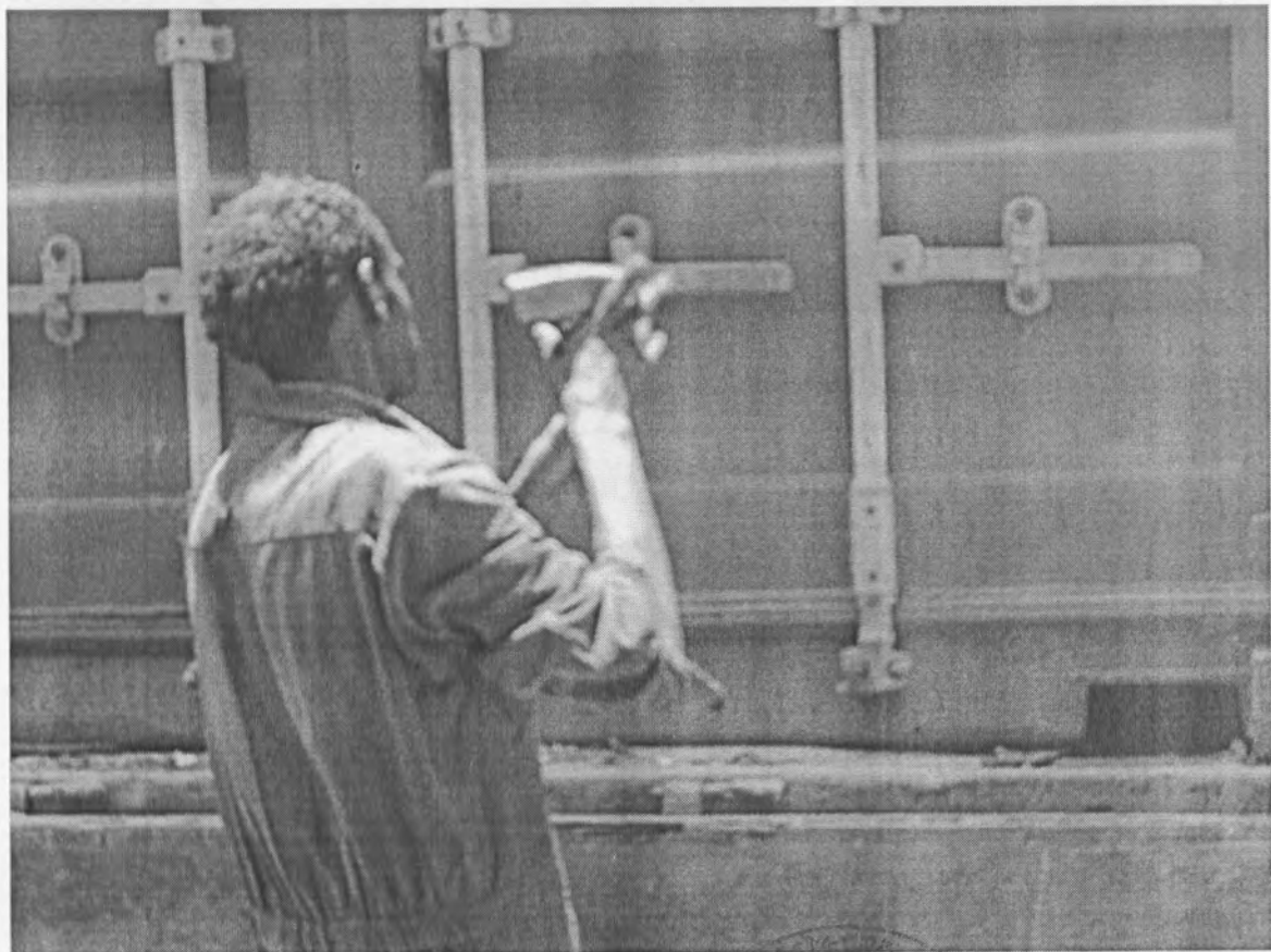
When container is opened