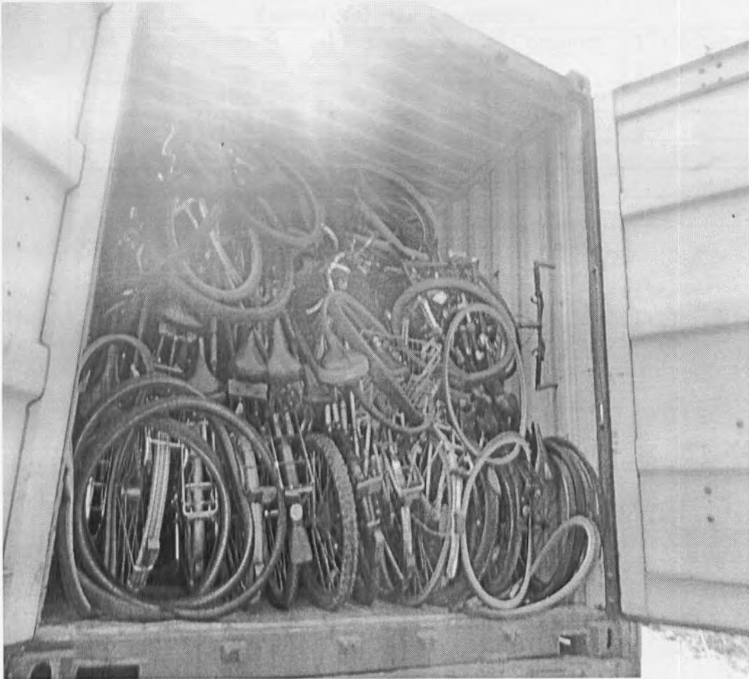
After container is opened