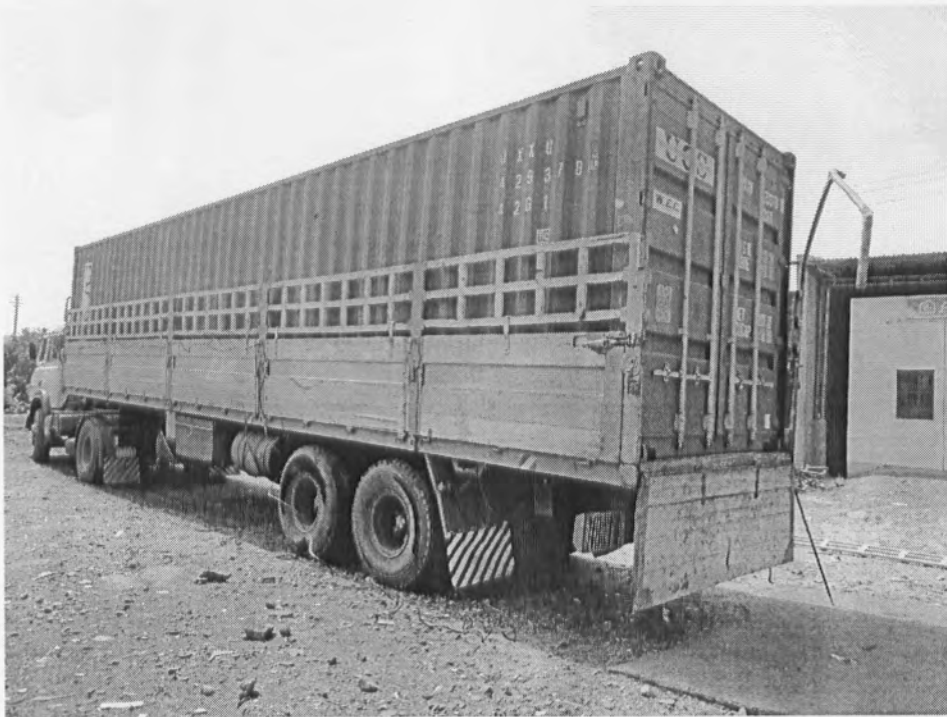
Container of bikes before unloading