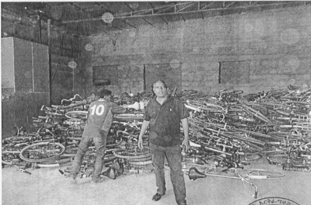
When bicycles are unloaded